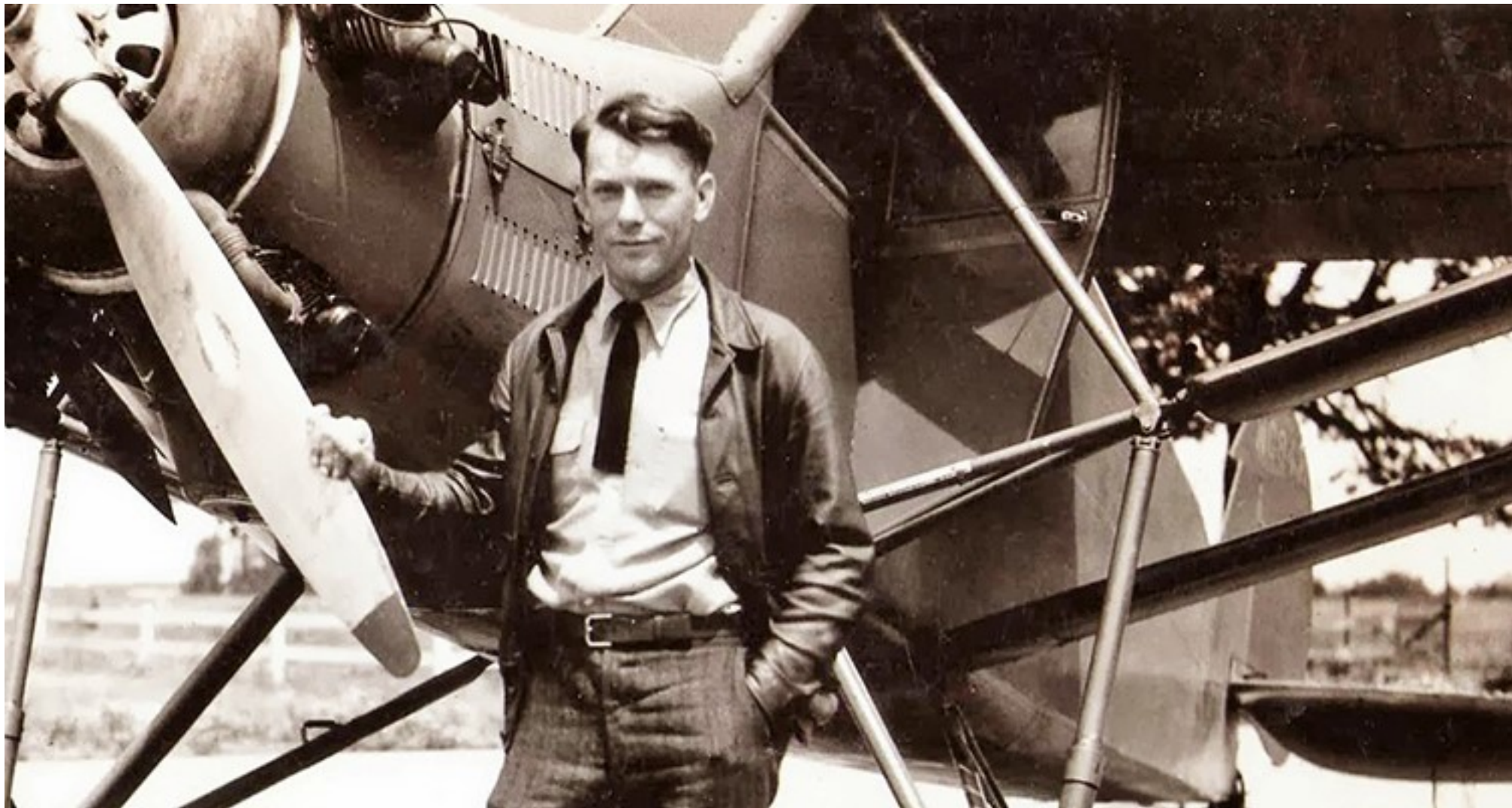
b) Douglas Corrigan