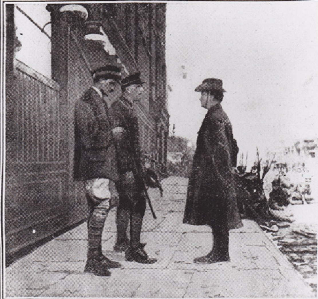
Patrick H. Pearse (shot), the "President of the Irish Republic," surrendering to the military.