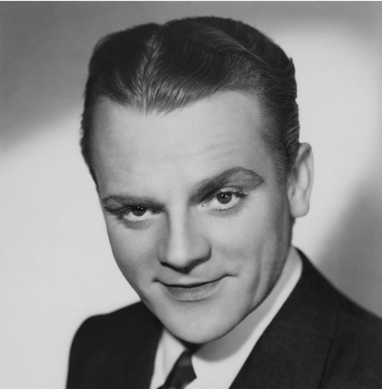
c) James Cagney