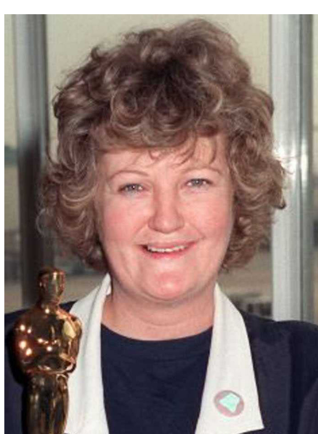
d) Brenda Fricker