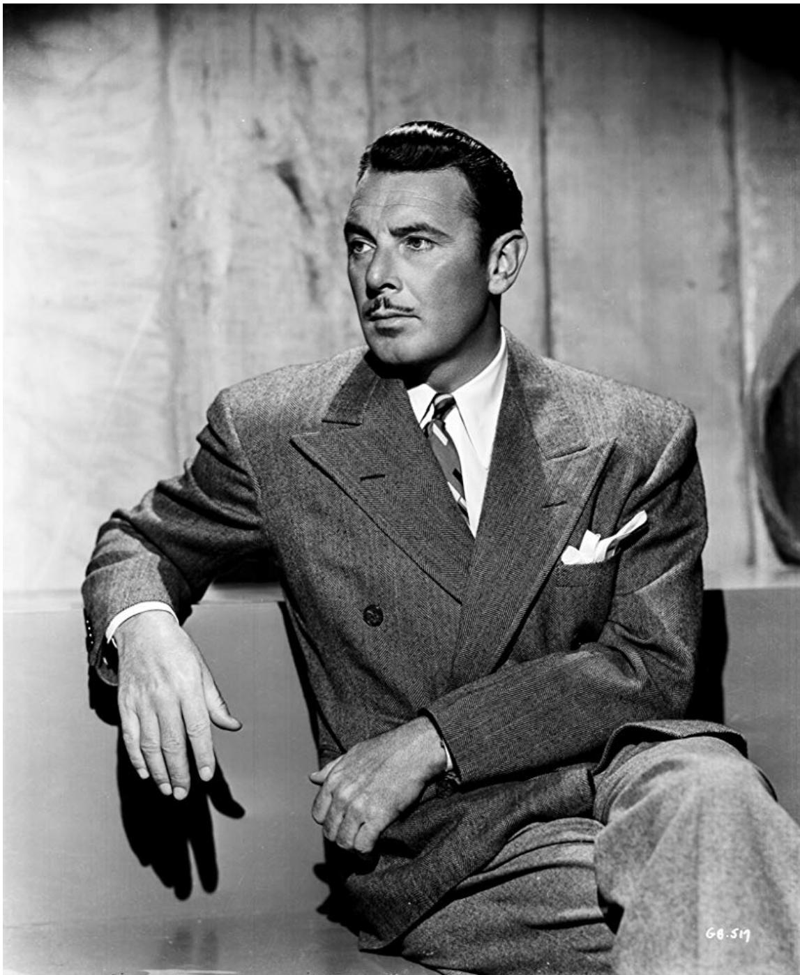
a) George Brent