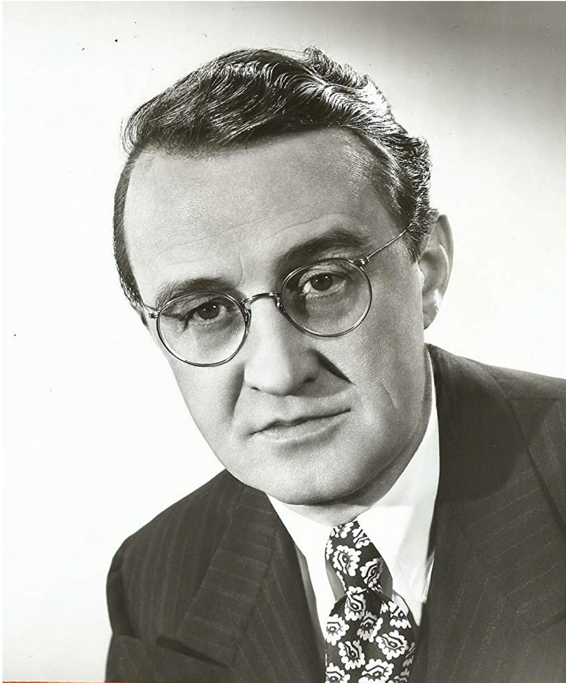
c) Arthur Shields