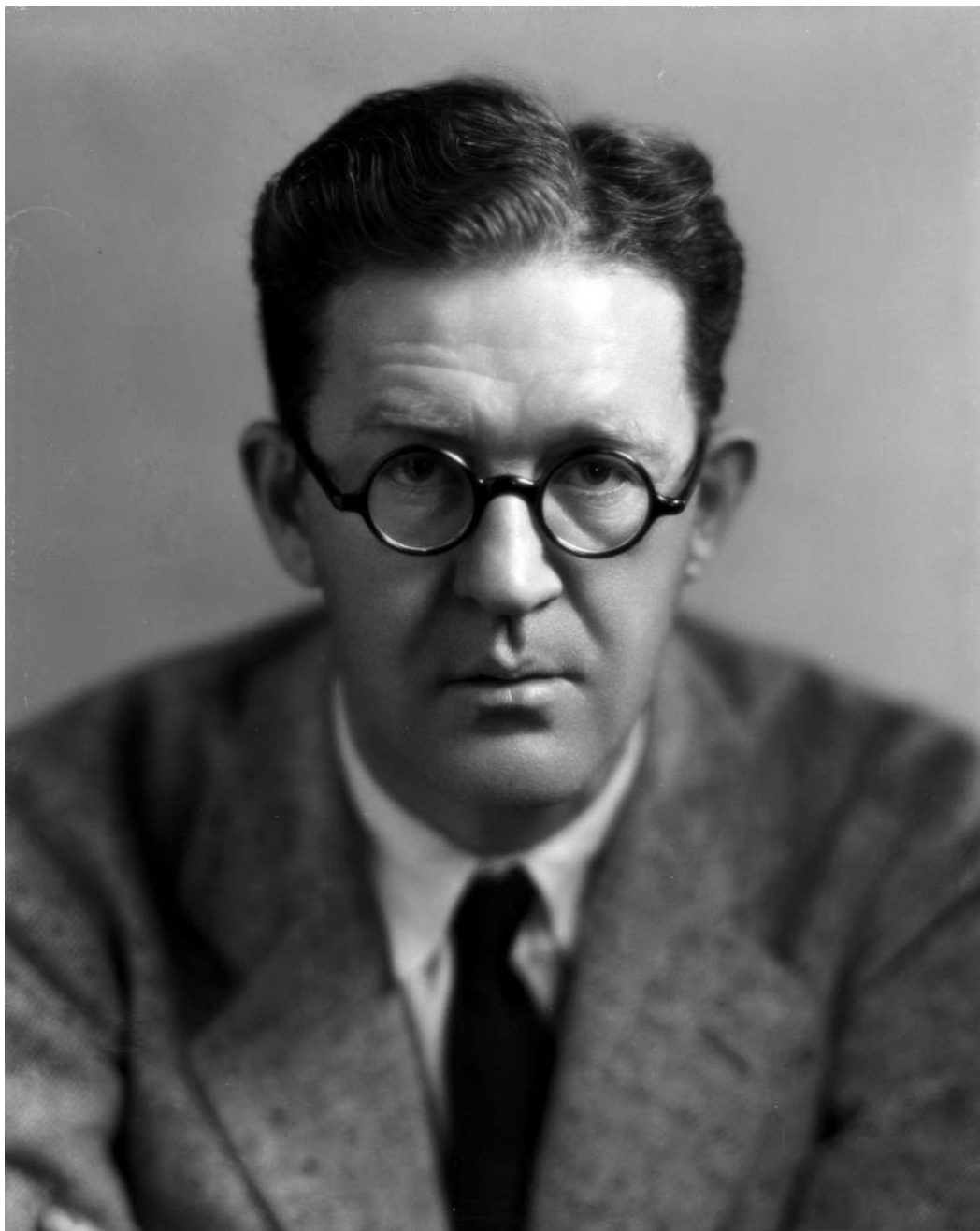
c) John Ford