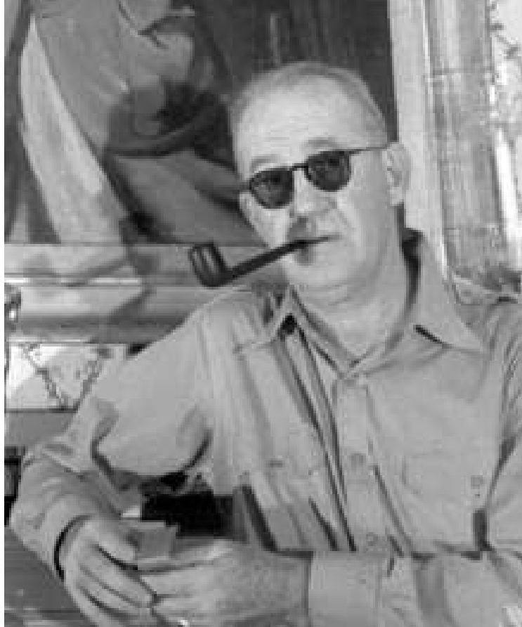
c) John Ford