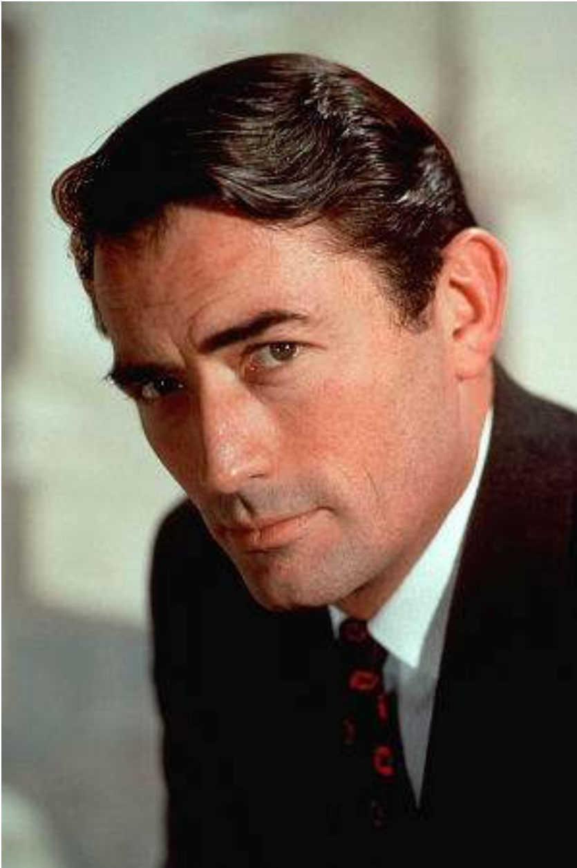
d) Gregory Peck