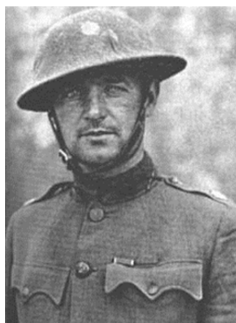
William "Wild Bill" Donovan as he appeared while commanding teh 69th NY (165 Infantry) during WWI.

http://purchase.tickets.com/buy/TicketPurchase Tickets $25