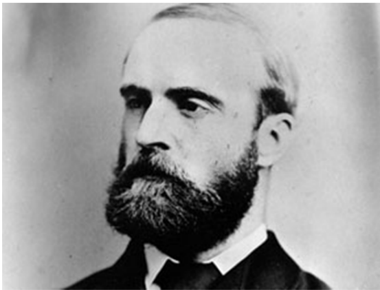
Charles Stewart Parnell was the founder and leader of the Irish Parliamentary Party.

The Army redesignated the now federalized 69th as the 165th Infantry (though it remained the 69th to the men in it) and placed it in the Rainbow Division. Donovan distinguished himself in command of the 69th, winning the Medal of Honor. After the war, Donovan was appointed an assistant United States attorney. He ran unsuccessfully as the Republican candidate for governor of New York in 1932. Donovan was sent on a number of diplomatic missions by President Roosevelt in the 1930s. When World War II began, Roosevelt named Donovan to head up the new Office of Strategic Services, or OSS. Under Donovan's leadership, the OSS proved itself a valuable asset in the American war effort. Through his work organizing the OSS, Donovan laid the groundwork for the Central Intelligence Agency, which was formed in 1947. When Donovan died in 1959, President Eisenhower remarked, "What a man! We have lost the last hero."