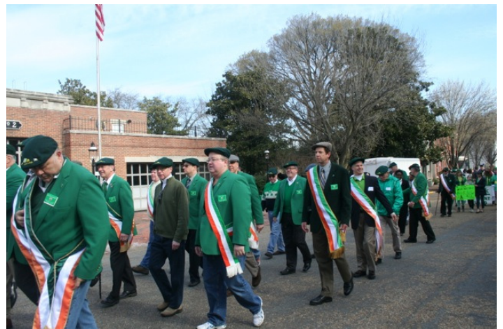
The Dooley proudly marches in the St. Patrick's Parade prior to the St. Patrick's Church Festival