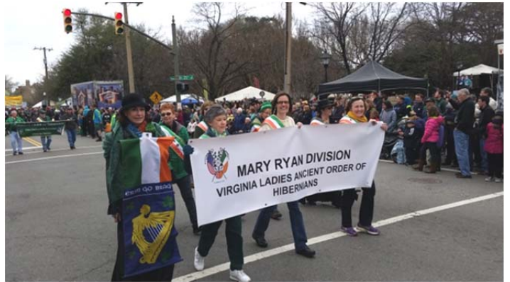
The Ladies Ancient Order of Hibernians