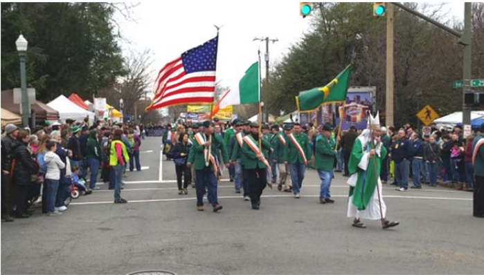
The Dooley Division led by St. Patrick