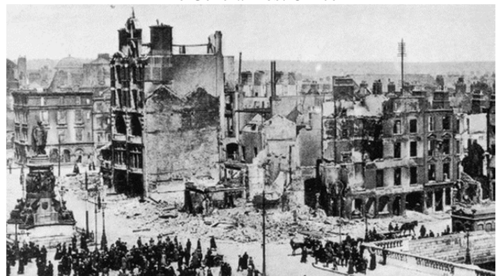
40 Children died during the Easter Rising