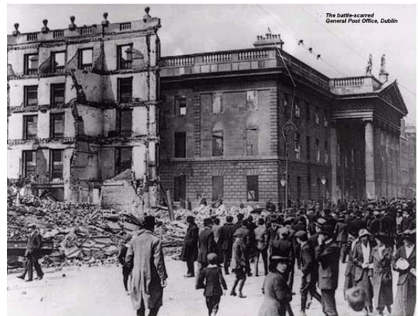
The General Post Office

Dublin in 1913 and many of the workers were attacked by the police. James Connolly was one of the founders of an army set up to protect workers. It was called the Irish Citizen Army. During the Easter Rising he was appointed Commandant-General of the Dublin forces. About 150 of the rebels took over the General Post Office in Dublin and James Connolly lead that group. He was wounded in the G.P.O. and was executed on the 12th of May 1916. He was the last of the leaders to be executed.