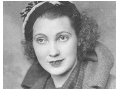
Donald Trump's mother, Mary Anne MacLeod