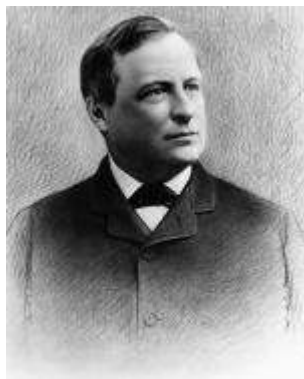
Franklin Gowen, president of the Philadelphia and Reading Railroad, circa 1885.

We may never know whether the Mollies carried out any murders, and what, if any, connections existed among the Mollies, the murders, the local Democratic Party, the Order of Ancient Hibernians, and the union formed in the coal regions in 1868. What we do know is that Frank Gowen, the ruthless president of the Philadelphia and Reading Railroad, was secretly buying enough mines to gain control of the industry, and had starved miners into submission during the disastrous "Long Strike" of 1875 to break the back of the Workingmen's Benevolent Association. The Mollies, in league with the local Democrats, had their own political machine, which controlled a number of local governments in Schuylkill County.