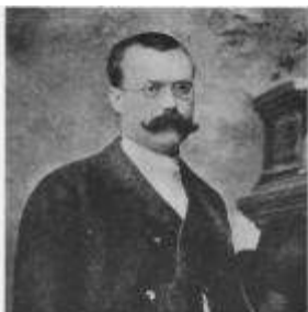
Pinkerton detective James McParland, circa 1886.

Molly Maguire was, supposedly, the leader of riots in Ireland against exploitative English landowners during the 1840s. In the 1850s, Irish coal miners brought the organization with them when they crossed the ocean to work in the anthracite coal fields of northeastern Pennsylvania. Conditions were terrible in the Pennsylvania mines - safety regulations were non-existent or neglected; breaker boys as young as six worked picking slate; families lived in poor company-owned houses, and were forced to shop at company stores; nothing except a few dollars compensated those injured or the families of those killed in this dangerous trade; and foremen frequently abused workers or undervalued the quantity of coal mined, which determined their wages.