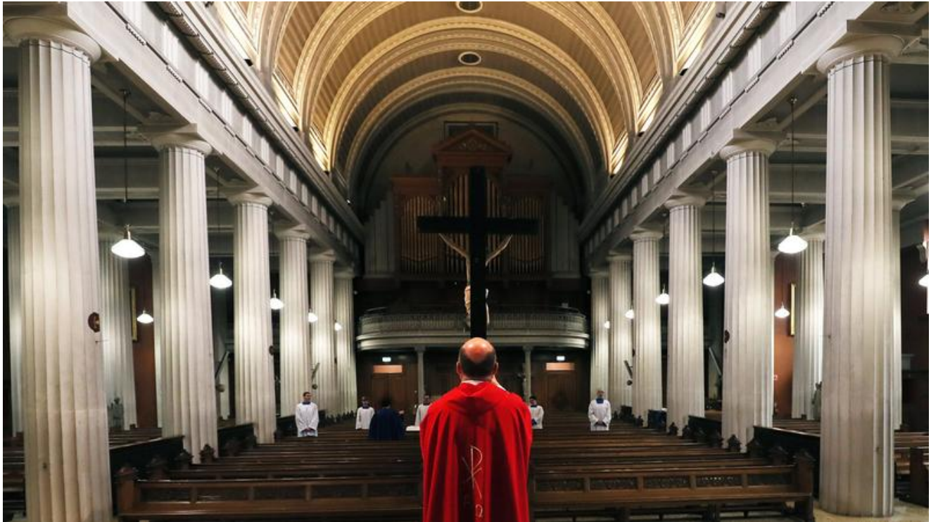
Public Mass has been banned across nations under lockdown