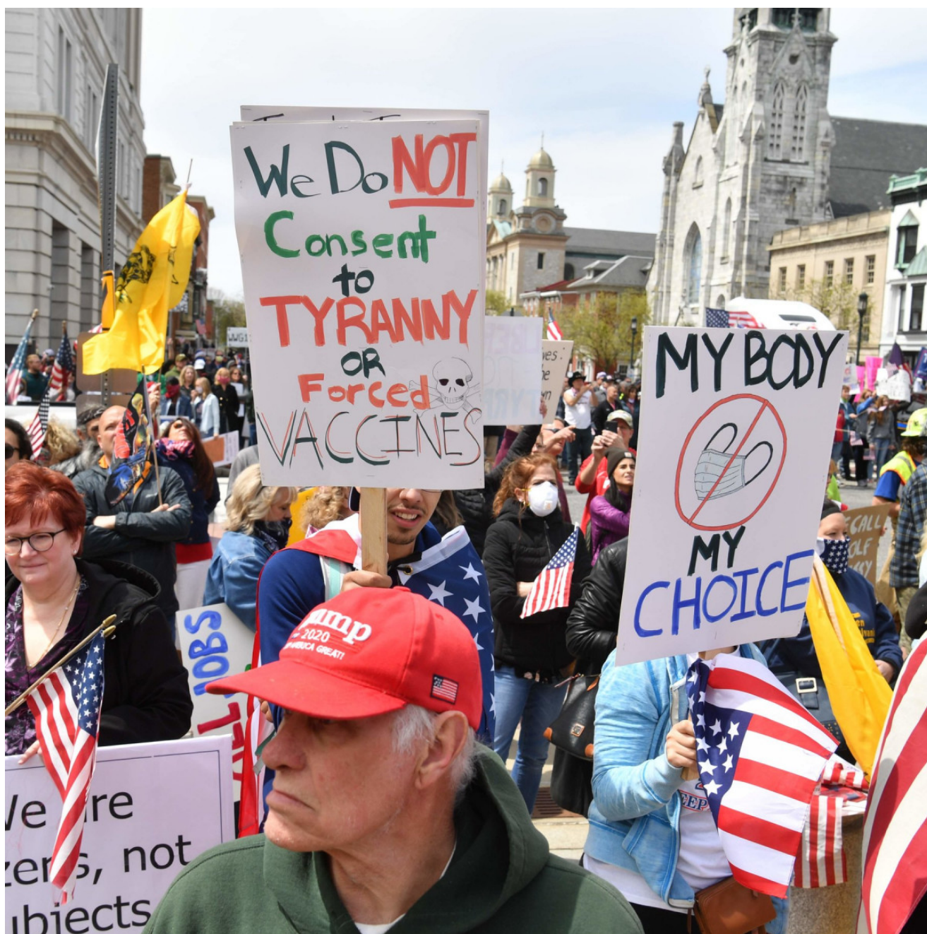
Americans protesting forced lockdowns

He adds there must be no penalties imposed on those who refuse vaccines or contact tracing, and mentions the folly of so-called experts that have proscribed measures to control populations as well as the tyranny of governments that enforce them.